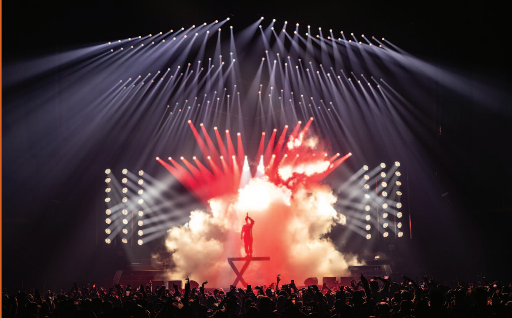
Opposite: The B stage "is part of Nathan's growth into arenas," Denholm says. "Clay and I spent a lot of time focusing on the importance of taking the experience out into the crowd." Above: The show's dualities are also reflected in the layout of the lighting rig, which looks almost as if the box in the CLOUDS TOUR had been blown wide open. Overhead are four chevron-shaped trusses, three pointing north and a fourth pointing south.

four chevron-shaped trusses, three pointing north and a fourth pointing south. A lower horizontal bar is also placed over the stage, with three vertical bars each at stage left and right. "We didn't want to do light pods this time," Joiner says, "but we didn't want to use too many rigging points. How could we get the same firepower without using too much truck space?"