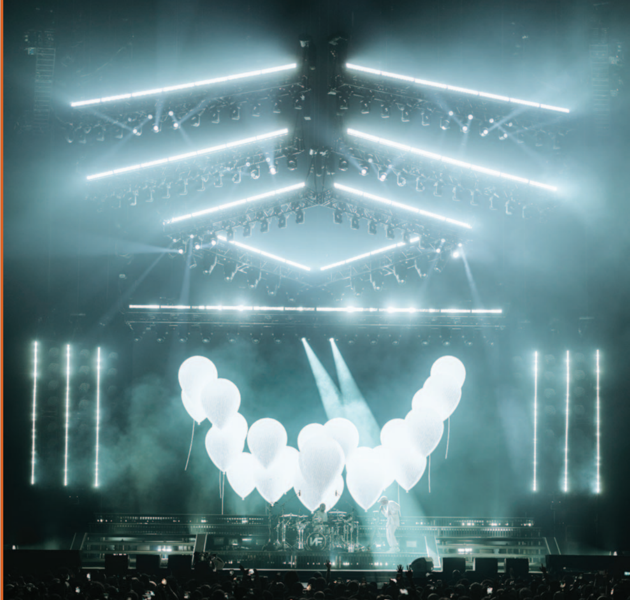
Above and opposite: The bountiful fog effects are created by custom units from Strictly FX as well as Le Maitre Low Smoke Generators. Strictly FX also supplied six Coral Series lasers.